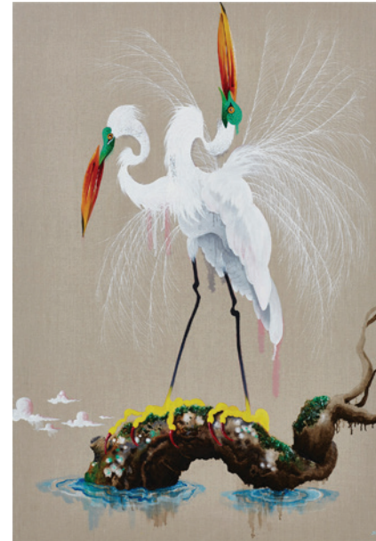
Above: Come Get You Some 2015 oil, charcoal, and floor stain & saw dust on linen, 130cm x 90cm