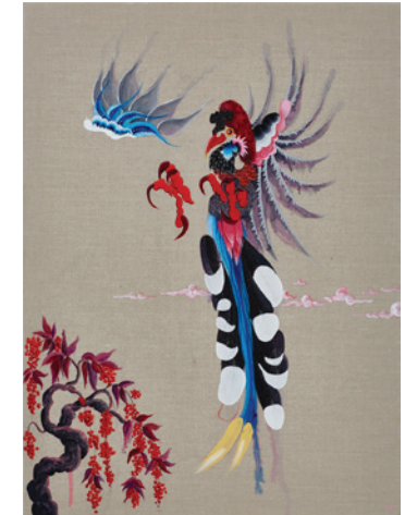
Top Right: The Tale of Goldtail 2015 oil, charcoal, and floor stain & saw dust on linen, 76cm x 56cm