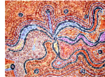
SNAKE VINE DREAMING