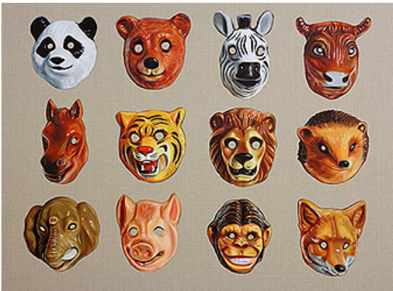
Choose Your Own Adventure , 2012 104cm x 140cm oil on linen