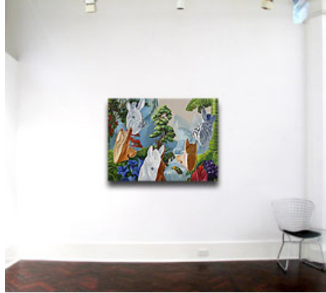
in situ on 3.7m wall