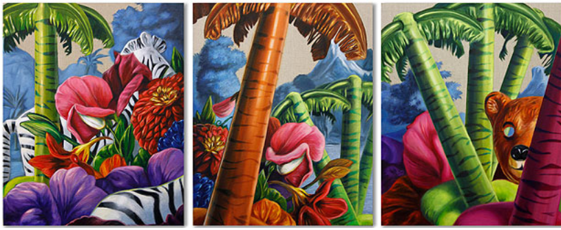
Eldorado , 2012 50cm x 40cm (x3) oil on linen