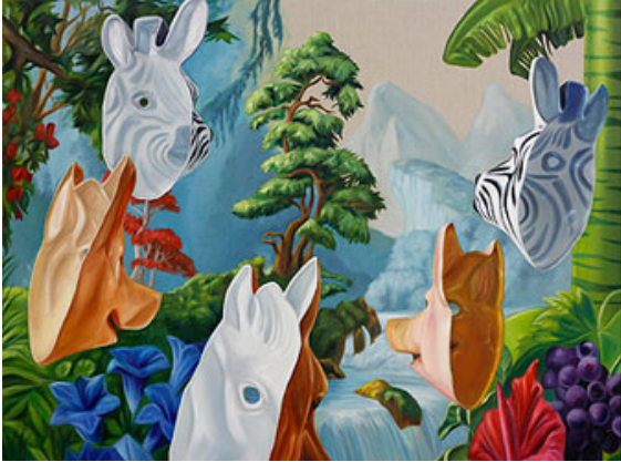
Springtime Adventure , 2012 104cm x 140cm oil on linen