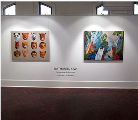
NATHANIEL KIVI Springtime Adventure 23 October - 10 November