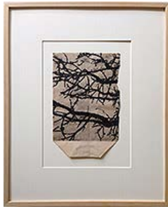
Christine Willcocks Memory Sticks III 2014 drypoint etching on old pharmacie bag 27cm x 17cm , (52 x 42cm framed)