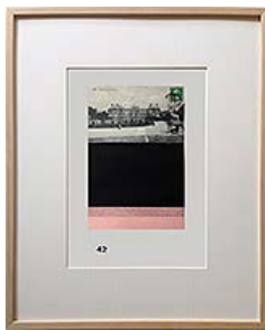
Christine Willcocks English Subtitles 2014 found postcard, ink, acrylic and graphite 26cm x 14cm , (52 x 42cm framed)