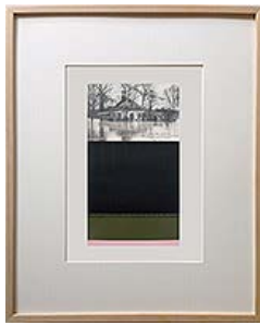
Christine Willcocks Station des Tramways 2014 found postcard, ink, acrylic and graphite 26cm x 14cm , (52 x 42cm framed)