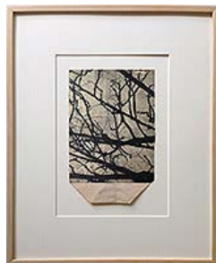
Christine Willcocks Memory Sticks II 2015 drypoint etching on old pharmacie bag 27cm x 17cm , (52 x 42cm framed)