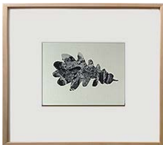
Christine Willcocks The Fallen - Turkey Oak 2014 etching with stencil 10cm x 15cm , (27.5 x 31cm framed)