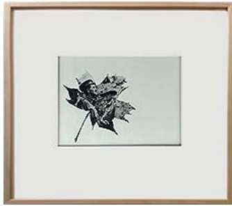
Christine Willcocks The Fallen - Norway Maple II 2014 etching with stencil 10cm x 15cm , (27.5 x 31cm framed)