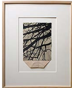
Christine Willcocks Memory Sticks I 2014 drypoint etching on old pharmacie bag 27cm x 17cm , (52 x 42cm framed)