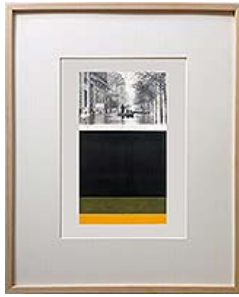
Christine Willcocks Inondations de Paris 2014 found postcard, ink, acrylic and graphite 26cm x 14cm , (52 x 42cm framed)