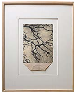
Christine Willcocks Memory Sticks V 2014 drypoint etching on old pharmacie bag 27cm x 17cm , (52 x 42cm framed)