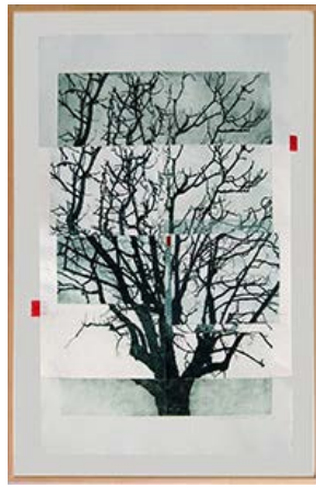
Christine Willcocks Fragments 2015 drypoint etching on layered Kozo 95cm x 55cm , (103 x 68cm framed)

Willcocks' visual transformations reflect a natural desire for retrospection, a need to find meaning and connections through the mental reconstruction of past