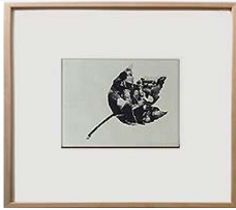
Christine Willcocks The Fallen - White Poplar 2015 etching with stencil 10cm x 15cm , (27.5 x 31cm framed)