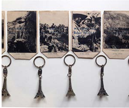
Christine Willcocks We Will Remember I - 11 2014 drypoint etching on old pharmacie bags with souvenir keyring 11cm x 7cm , (paper size, key ring included) Priced individually