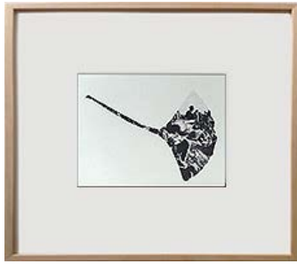
Christine Willcocks The Fallen - Ginkgo Biloba 2014 etching with stencil 10cm x 15cm , (27.5 x 31cm framed)