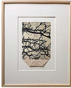
Christine Willcocks Memory Sticks IV 2014 drypoint etching on old pharmacie bag 27cm x 17cm , (52 x 42cm framed)