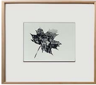
Christine Willcocks The Fallen - Norway Maple 2014 etching with stencil 10cm x 15cm , (27.5 x 31cm framed)