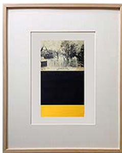
Christine Willcocks The Yellow Line 2014 found postcard, ink, acrylic and graphite 26cm x 14cm , (52 x 42cm framed)