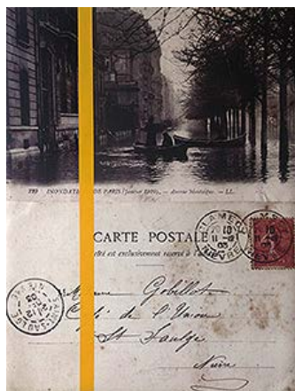
Christine Willcocks The Number 1 Line to Chateau de Vincennes 2015 acrylic on transparency film 110cm x 84cm