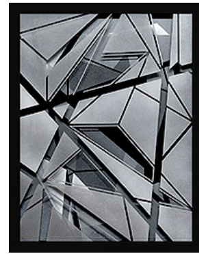
Zac Koukoravas Modular Suspension 2016 acrylic paint on glass and acrylic 88cm x 68cm