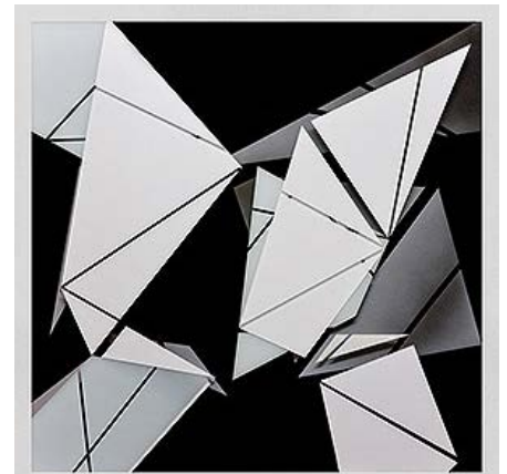
Zac Koukoravas Stark Reality 2016 acrylic paint on glass and acrylic 103cm x 103cm