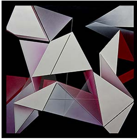
Zac Koukoravas Super Wow 2016 acrylic paint on glass and acrylic 104cm x 104cm