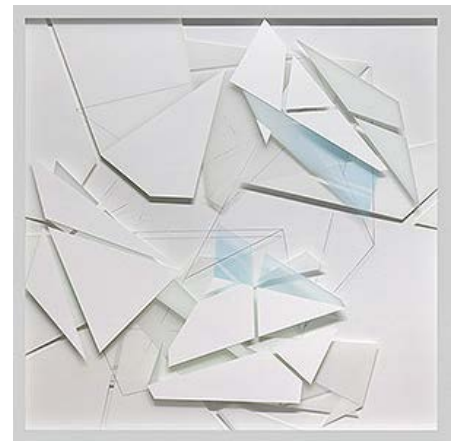
Zac Koukoravas Over Sentimental 2016 acrylic paint on glass and acrylic 103cm x 103cm