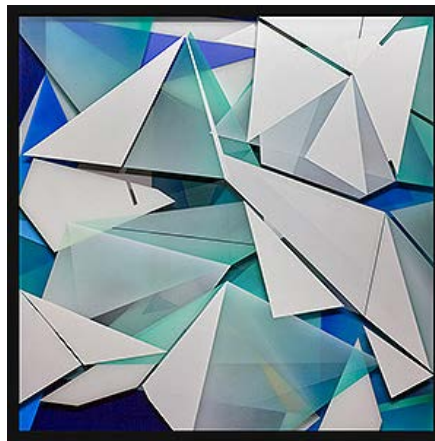
Zac Koukoravas Self Assemblage 2016 acrylic and enamel paint on acrylic 103cm x 103cm