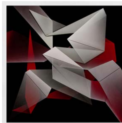
Zac Koukoravas Supermodified 2016 acrylic paint on glass & acrylic 103cm x 103cm

Koukoravas gambles with the dichotomy of order and chaos whilst experimenting with abstract forms and randomness. This experimentation has resulted in Supermodified , a series of pieces that push the boundaries of the materials he uses while exploring processes of aleatoricism. To create the Supermodified series, Koukoravas has rolled the dice and relinquished partial control of his creative processes to chance. Supermodified is diverse a series of pieces showcasing innovative techniques applied to glass and acrylic panels in paintings, light boxes and multimedia.