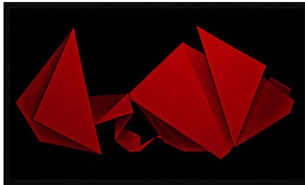
Zac Koukoravas Killer Mood 2016 acrylic paint on acrylic 88cm x 143cm