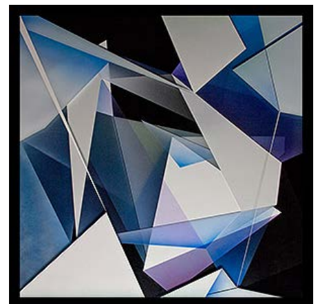
Zac Koukoravas Hyperloop 2016 acrylic paint on glass and acrylic 103cm x 103cm