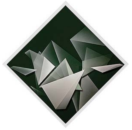
Zac Koukoravas Point of No Return 2016 acrylic paint on glass and acrylic 106cm x 106cm