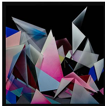
Zac Koukoravas Hyper Ballad 2016 acrylic and enamel paint on glass and acrylic 103cm x 103cm